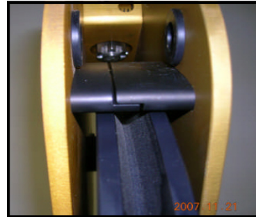
Cable shrouds reduce "line jump"

The Wireline Technologies, Inc. 16" and 20" Slickline Sheave feature a lightweight composite wheel, high strength aluminum and stainless steel structural components, and a simple side loading system that provides easy line placement. Incorporation of cable shrouds above the wheel prevents the line from "jumping sheave." Side locking design provides in-