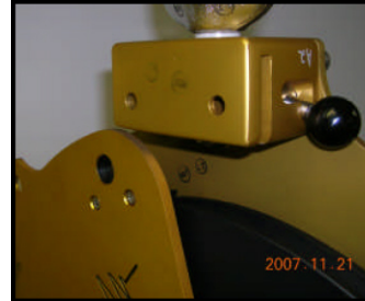
Spring loaded / positive side locking pins