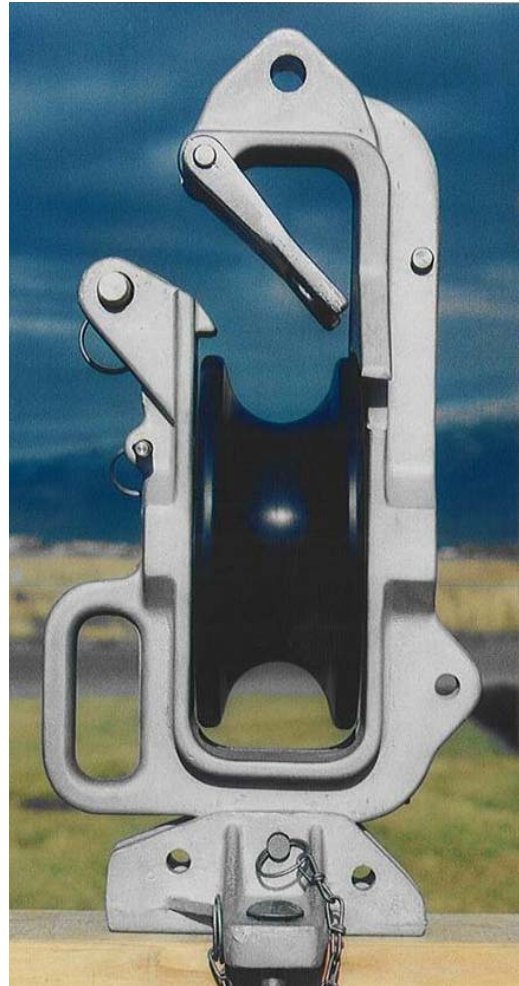
WTI Universal Distribution Block Shown with WTI's Cross-Arm Bracket (p/n CB-100)