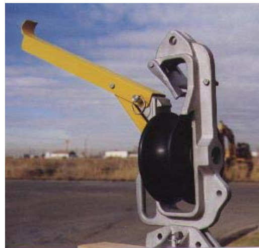
WTI Universal Distribution Block Shown with WTI's Helicopter Arm (HA-100/long or HA-200/short)