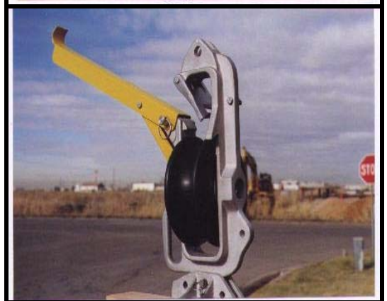
Shown with available helicopter arm (HA-